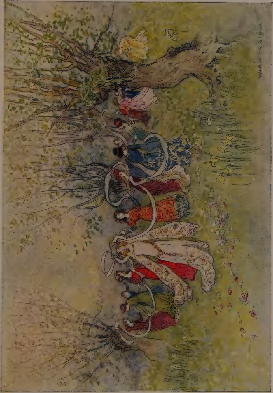
'THE FAIREST COMPANY OF LADIES THAT EVER MAN HAD SEEN'